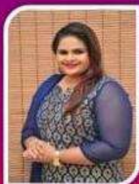
Ms. Vidyullekha Raman Famous Comedian From 6:00 pm – 6:30 pm